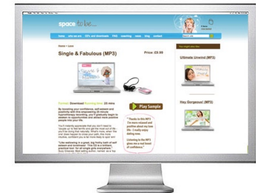
Website - Store page for MP3 download